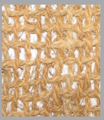
400 gsm Coir Blanket